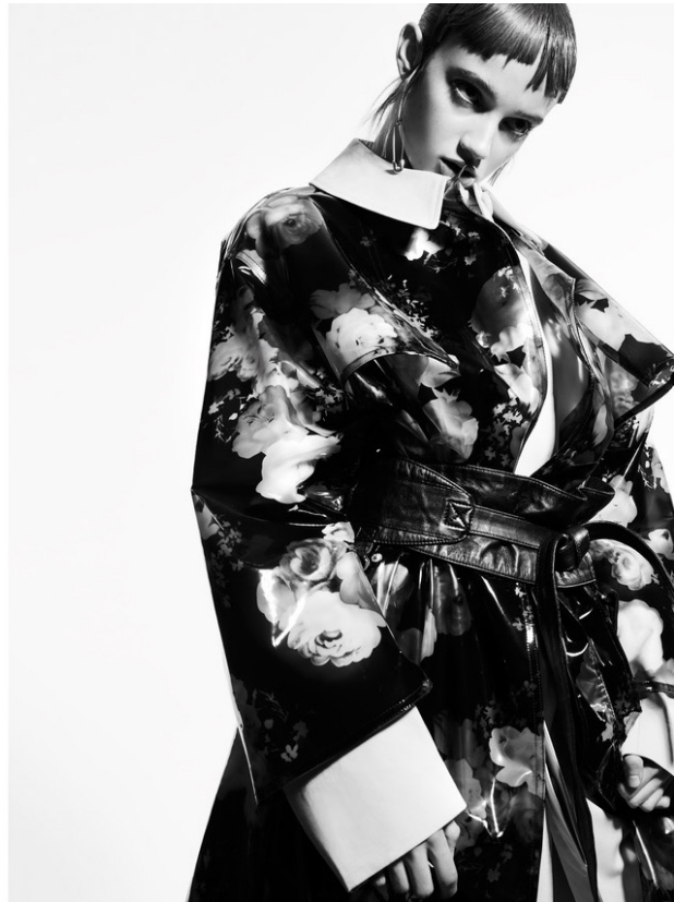
image on right: plastic trench with flowerprint DIESEL / creme jacket underneath Bottega Veneta / belt by Isabel Marant