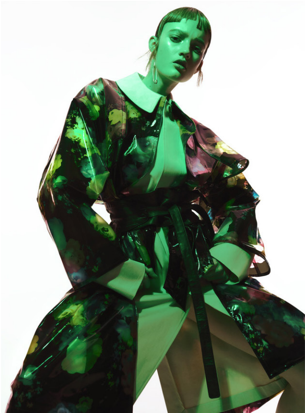
image on left: plastic trench with flowerprint DIESEL / creme jacket underneath Bottega Veneta / belt by Isabel Marant