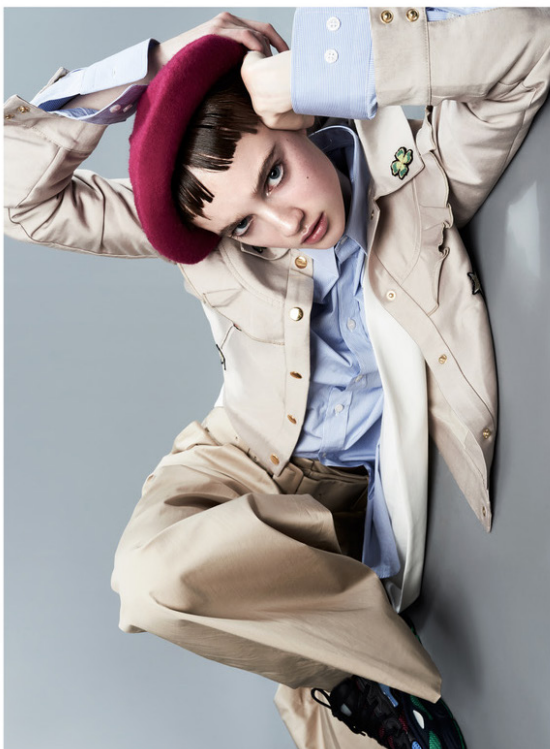
image on left: jacket by &Other Stories / pants by Alexander Wang / sneakers vintage Adidas by Raf Simons / hat by Gucci / shirt by Topshop Unique