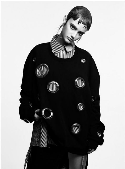
image on right: sweat with metal rings Diesel Black Gold / long black dress underneath Hermes / striped shirt by Tommy Hilfiger