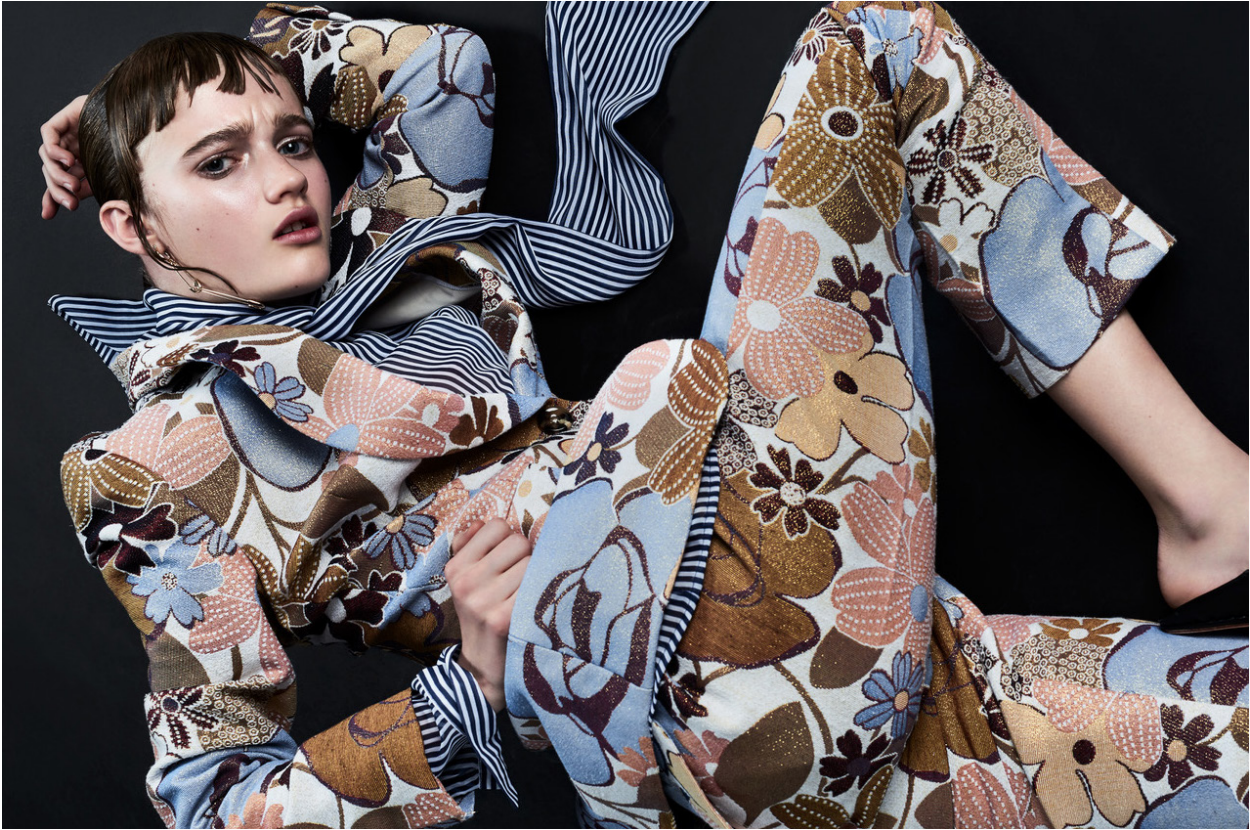
flower suit by Claes Iversen / striped shirt by Michael Kors Collection